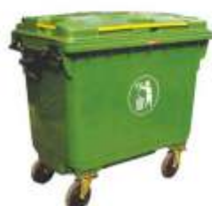
CODE: QEELDPE (Capacity 65-1.1M 3 )