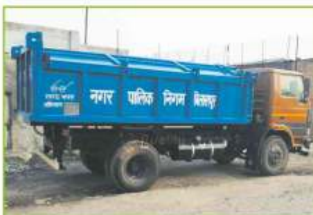
QEECTP - 4 M 3