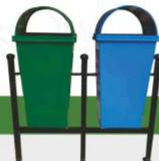
CODE : QEE DH BIN (Capacity 40-300 Ltr.)