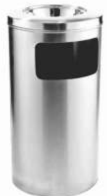
Code : QEE SS-40LP