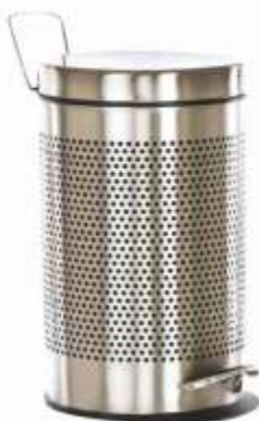
Code : QEE SS-10LP