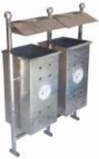
Code : QEE HD-80L