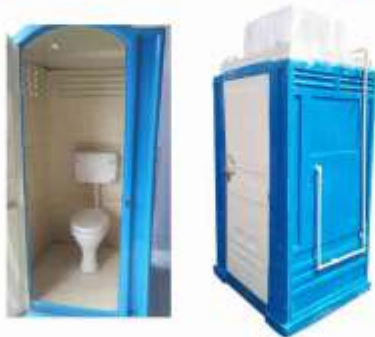
Model : QEEPTSS - 1STD