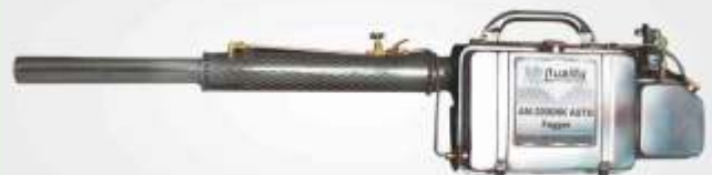
QEEFOG - 2000NK