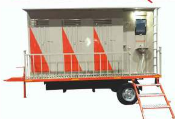
Model : QEEMT - 6STGI