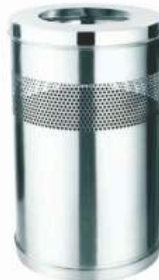
Code : QEE SS-20L