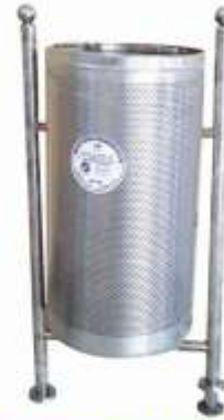
Code : QEE SB-100L