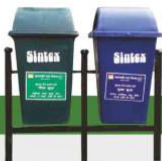
CODE : QEE DH BIN (Capacity 40-300 Ltr.)