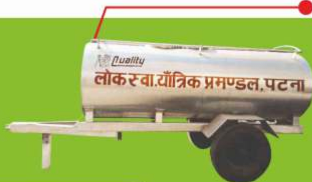
Model : QEEWTSS - 3LT