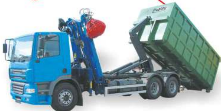
Model : QEEHL - 14M 3