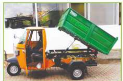
QEETP - 1.2 M 3