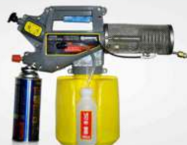
QEEFOG - 2000NK-M