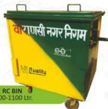
Code : QEE RC BIN Capacity 500-1100 Ltr.