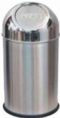
Code : QEE 40L