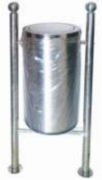
Code : QEE SB-40L