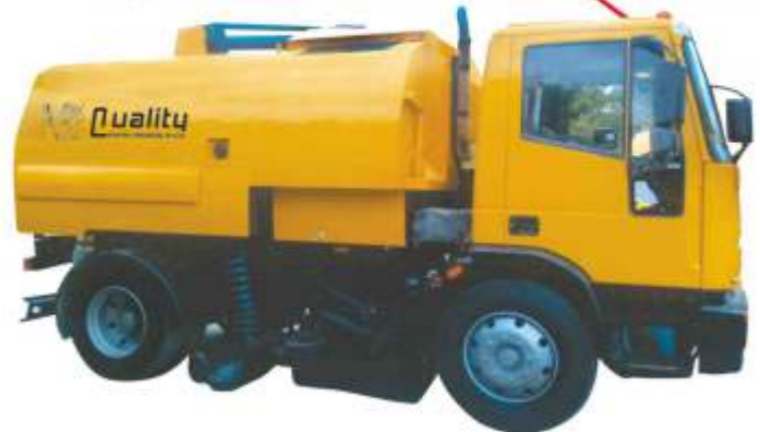
Model : QEESWEEP - 4M 3