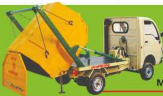
Model : QEEDP - 2 M 3