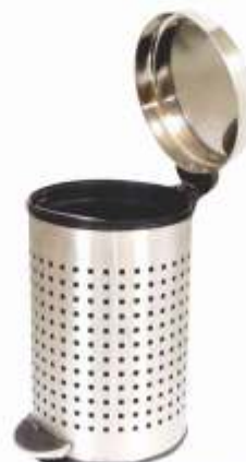
Code : QEE SS-20LP