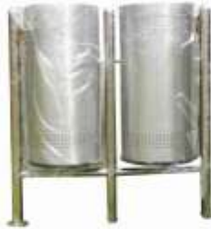
Code : QEE SB-10L