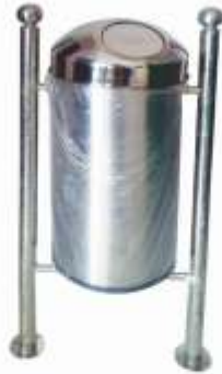
Code : QEE SB-60L