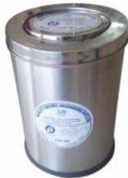
Code : QEE SS-10L