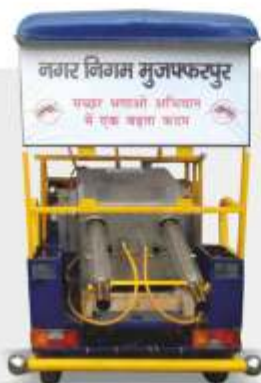
E-RICKSHAW INSTALLATION FOGGING MACHINE