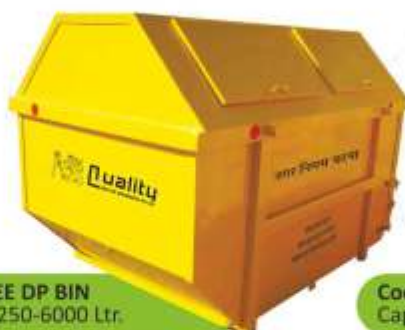
Code : QEE DP BIN Capacity 250-6000 Ltr.