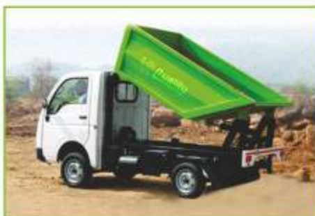
QEEHTP - 1.8 M 3