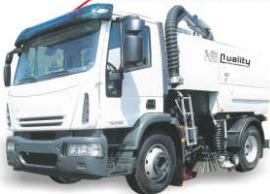
Model : QEESWEEP - 6.5M 3