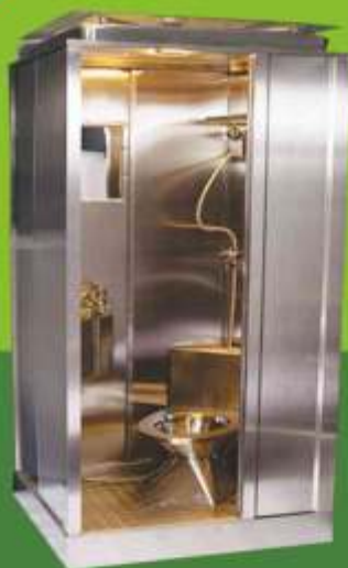
Model : QEEPTSS-Portable Toilet