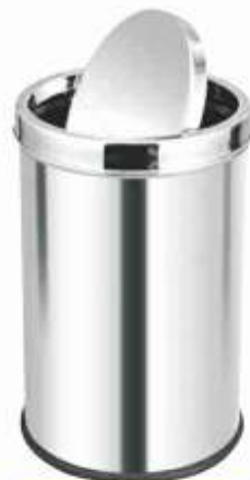
Code : QEE SS-40LS