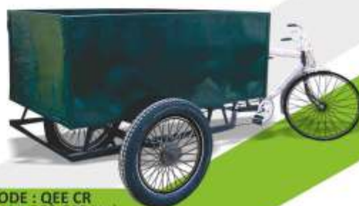
CODE : QEE CR (Capacity 200-800 Ltr.)