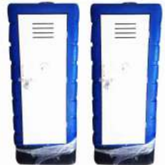
Model : QEEPT - 1STLLDPE