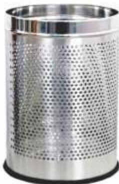
Code : QEE SS-40L