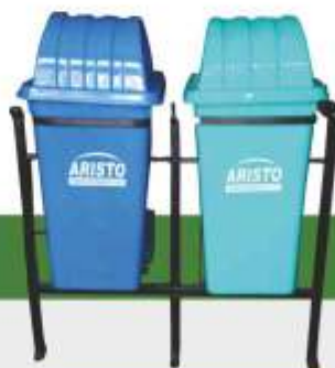
CODE : QEE DH BIN (Capacity 40-300 Ltr.)