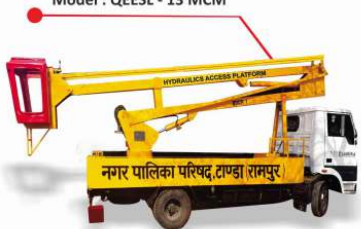
Model : QEESL - 13 MCM