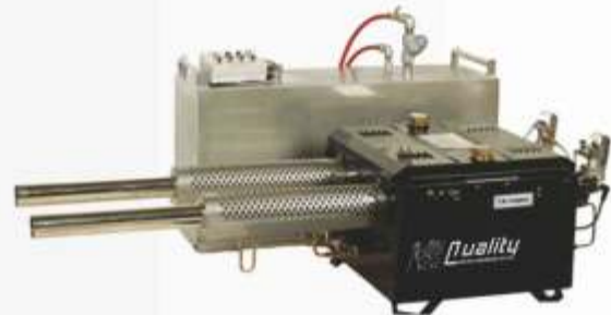
QEEFOG - 4000NK