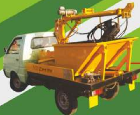
Model : QEESCOOP - 200LC Manhole Desilting Machine