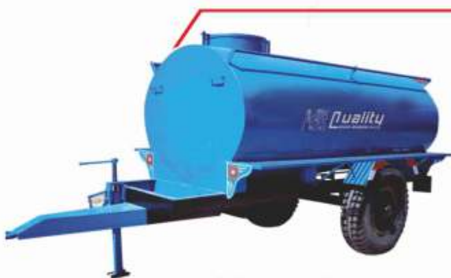
Model : QEEWT - 3LT