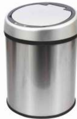
Code : QEE SS-40LD