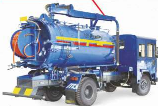
Model : QEESJM - 8LCH