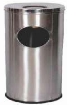
Code : QEE SS-20LP