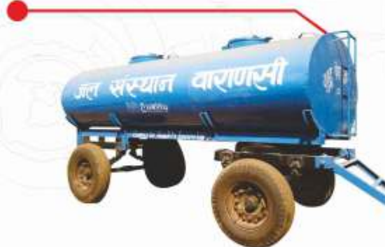
Model : QEEWT - 4LT