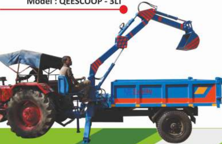
Model : QEESCOOP - 3LT