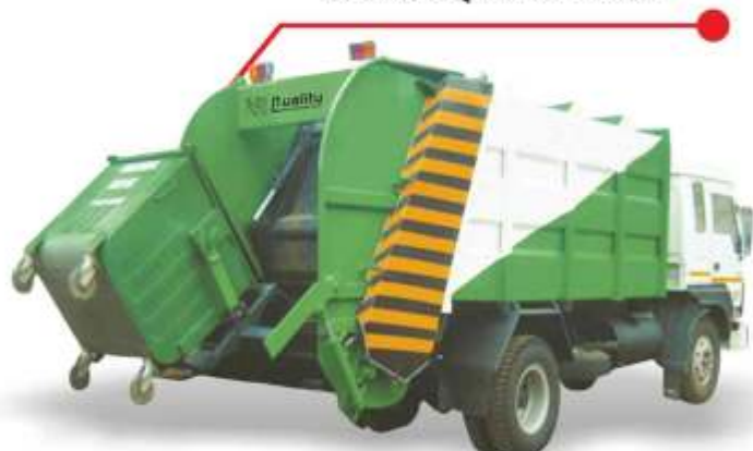
Model : QEEPAC - 14M 3