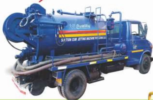
Model : QEESJM - 4LCH