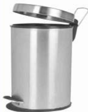
Code : QEE SS-20LP