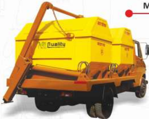
Model : QEETBDP - 6 M 3