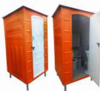
Model : QEEPT - 1STO