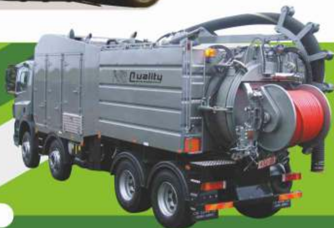
Model : QEERSSJM - 10LCH