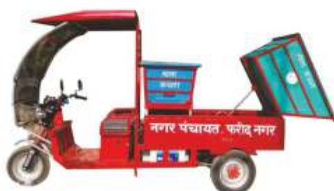
CODE : QEE TP (Capacity 350-800 Ltr.)