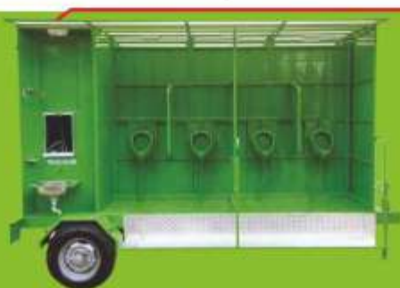
Model : QEEMU - 4ST