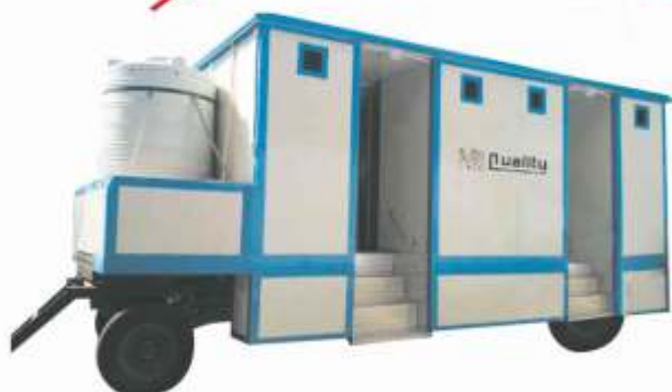
Model : QEEMT - 4STPPGI