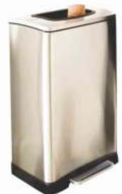
Code : SS BIN