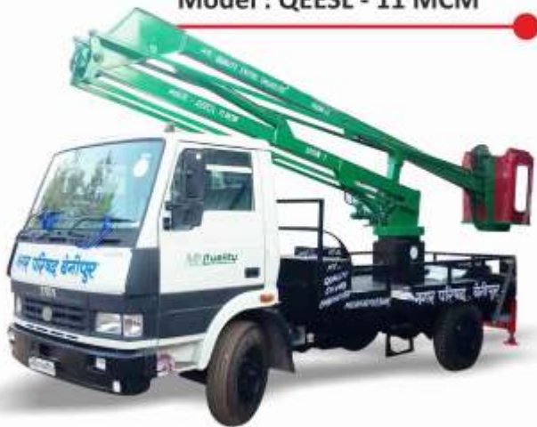
Model : QEESL - 11 MCM