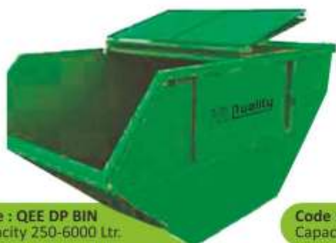
Code : QEE DP BIN Capacity 250-6000 Ltr.

As one of the leading entity of this domain, we are engrossed in providing supreme quality Dust Bin. The offered bin finds wide application use in hotels, offices, restaurants, malls, parks and other similar places for keeping the environment neat and clean. This bin is manufactured using quality materials and available in all different sizes to meet the requirements. Apart from this, clients can get the bin from us at reasonable rates.