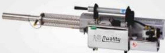
QEEFOG - 2000N