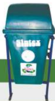
CODE : QEE DH BIN (Capacity 40-300 Ltr.)