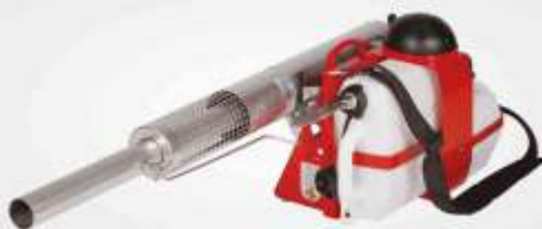
K - 10 SP