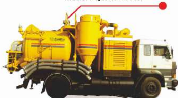
Model : QEEHF - 6LCH